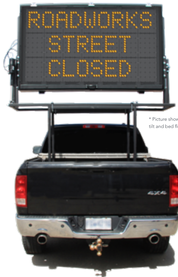
* Picture showing optional power tilt and bed floor mounts

Ver-Mac's TM-548 is a full-matrix truck-mounted message sign that is powered from the truck's battery. The TM-548 offers full graphic capability including several one touch arrow and directional display and sequencing functions. It can display 3 lines of text and 9 characters per line using the default font. The TM-548 features the innovative V-Touch controller that plugs into the cigarette lighter and a manual up/down bracket. The TM-548 is ideal for highway construction and maintenance crews, highway stripping trucks, highway emergency and helper trucks.