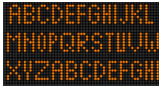
3x7 font (up to 12 characters)